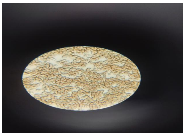
Figure.1 - Hemolytic activity of Leaf extract

extracts of Nerium oleander were examined under a compound microscope. The treated RBCs displayed significant alterations, most notably the transformation into echinocytes. After just one minute of treatment, approximately 95% of the cells exhibited this echinocytic morphology. These changes suggest a disruptive interaction between components of the leaf extract and the RBC membrane. In contrast, treatment with the flower extract did not result in any noticeable alterations to RBC morphology, indicating a potentially lower or different bioactive profile in the floral extract 1 .