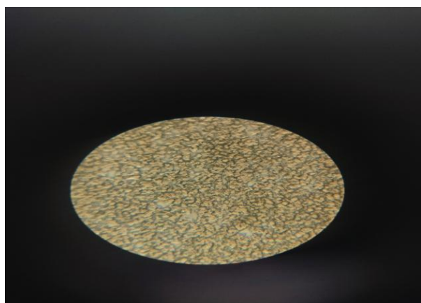
Figure.2 -Hemolytic activity of flower extract

The tube method was employed to assess the hemolytic activity of Nerium oleander leaf and flower extracts on red blood cells (RBCs). Post-centrifugation observations revealed that the